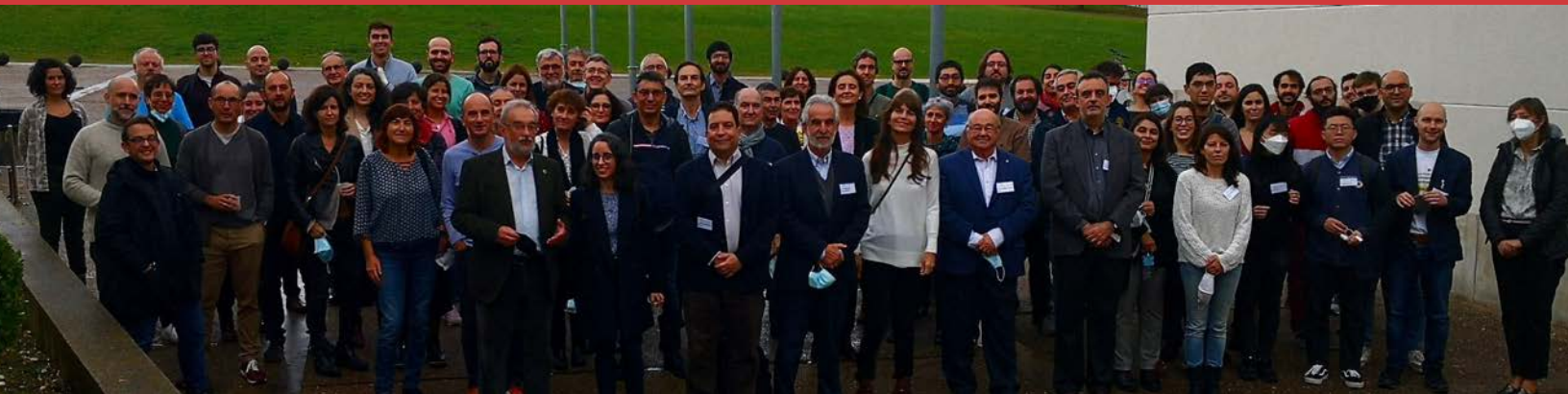
Attendees of the 2021 Joint Annual Meeting of the IEEE Magnetics Society Spain Chapter and the Spanish Club of Magnetism (CEMAG), held at Girona.

to provide pre-doctoral students and early-career scientists in magnetism, insight into job opportunities beyond the academic world, and as a secondary objective to give senior researchers a view into the latest developments in industry. These are carried out in two parts; first, with a presentation by the expert of approximately 45 minutes, where the speaker presents his/her career, current job and its relationship with magnetism, and then a round of questions which lasted a maximum of 45 minutes. We have had two talks that can be now watched at YouTube.com: